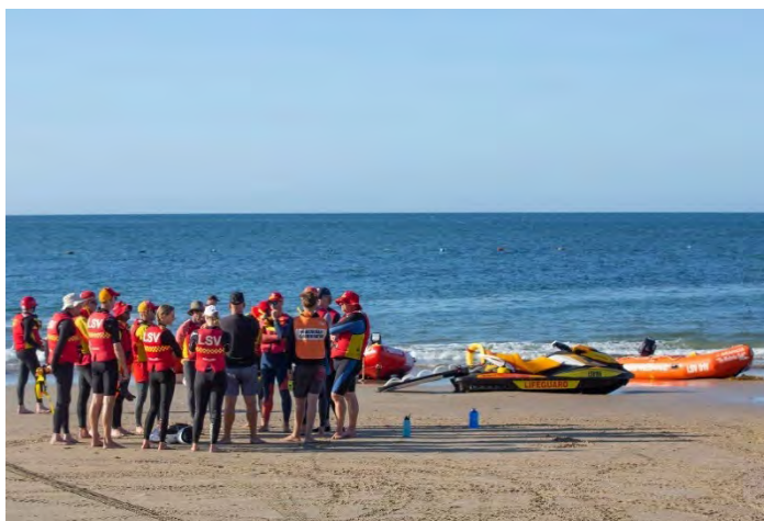
IRB Drivers and Crew Briefing

This season, a total of 272 members held their Bronze Medallion, including 52 who achieved the award for the first time. We have 53 members qualified as IRB Crew, 31 members hold the Silver Medallion IRB Driver award, and 20 members hold the Advanced Resuscitation Techniques (ART) qualification. Additionally, 39 members achieved their Surf Rescue Certificate (SRC), 8 members successfully completed the Silver Medallion Patrol Captain's Course, 9 members qualified as new IRB Crew, and 2 members completed their IRB Driver training for the first time. Each of these achievements strengthens our patrols and reinforces the Club's high standards of safety and competency.