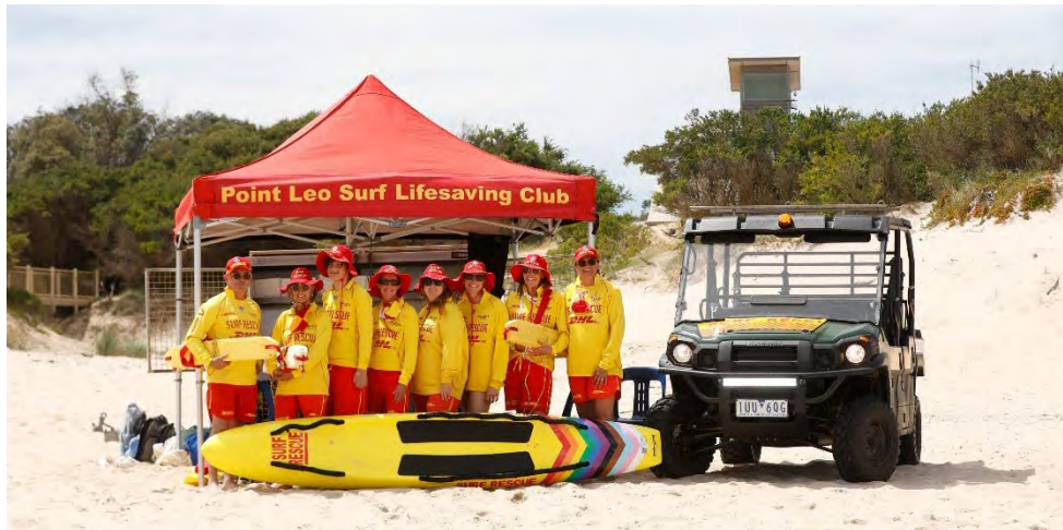
The Legends on patrol with the Pride Board

Our Pride Patrol was once again a highlight, reinforcing Point Leo's ongoing commitment to welcoming and supporting LGBTQIA+ members and allies. It drew strong member participation and helped create greater visibility for diversity and inclusion in lifesaving. It's moments like this that show how culture is lived through action.