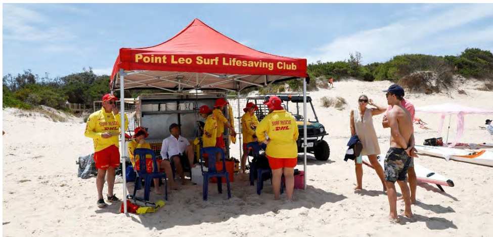
The Legends on patrol