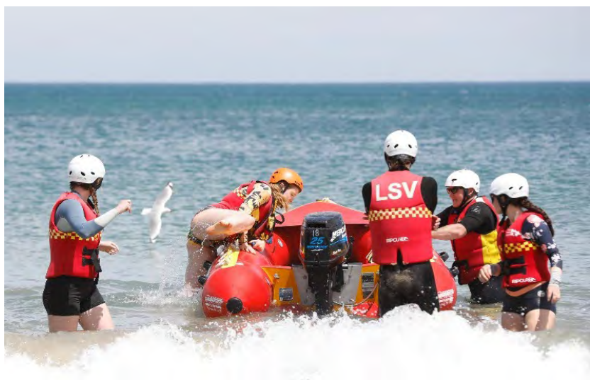
Training on the IRB Course

It's been particularly inspiring to watch the enthusiasm of our new