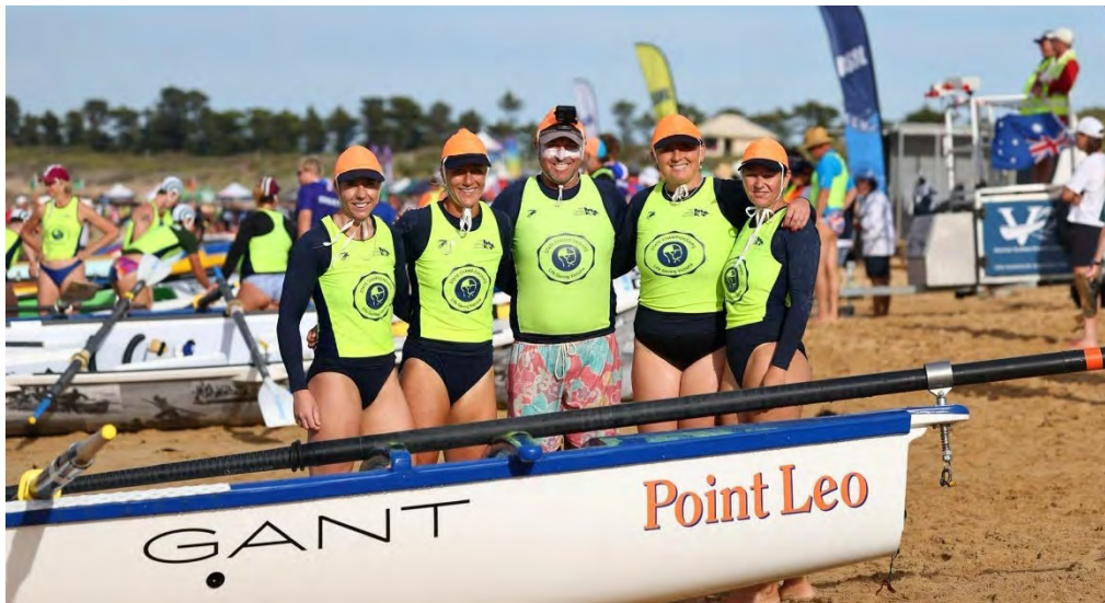
The Point Leo Mimosas

The spirit and camaraderie among our Boaties was unmistakable, making it a real pleasure to support and watch them in action. This season saw the exciting addition of four new crews joining Point Leo SLSC, bringing fresh energy and enthusiasm to the section. A very warm welcome to all our new boat rowers — it's fantastic to have you on board. With these additions, we had an impressive seven crews representing Point Leo at Aussies, achieving some fantastic results.