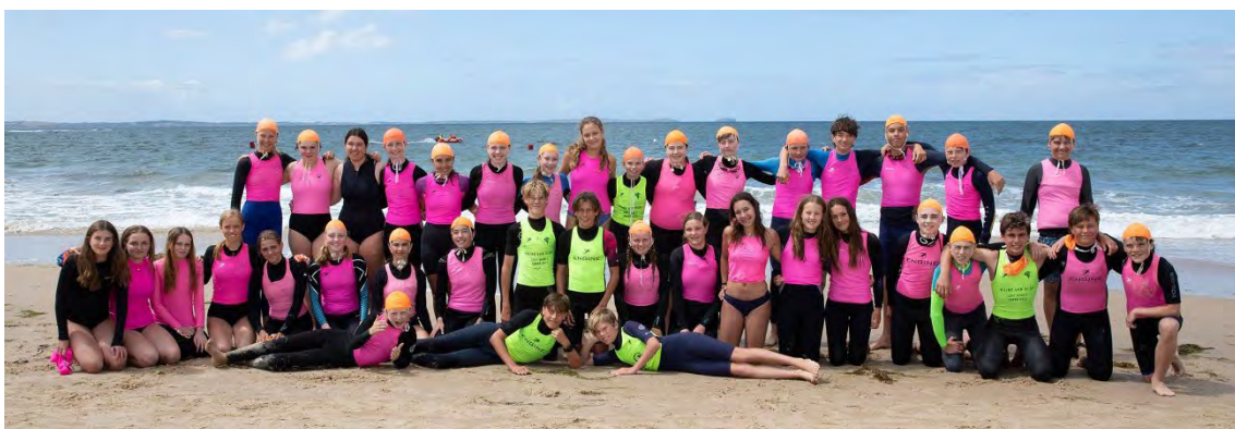
U/14 Nipper Group