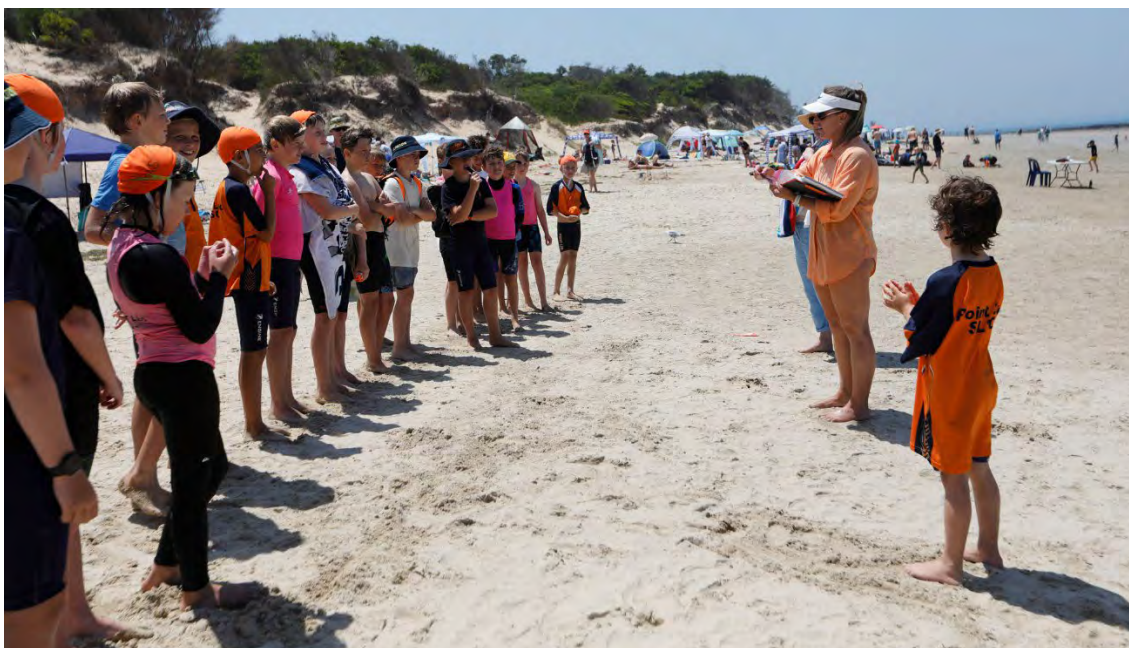
An Age Group Manager talking to a group of nippers

AGMs and AAGMs, we salute you. You didn't just organise chaos – you made it look fun. From calming nervous newcomers to handing out "Nipper of the Day" high-fives, your leadership, empathy, and enthusiasm were on full display every session. You are the heart of this program – and probably the reason so many kids keep coming back each day.