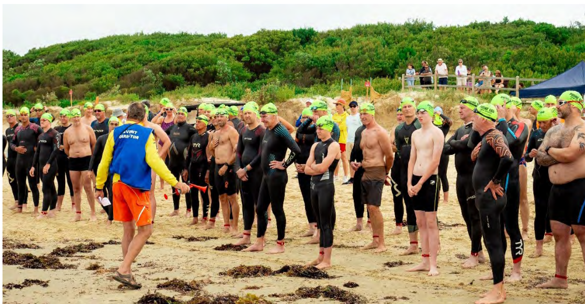
On the start line at the 2024 Boxing Day Swim Classic

The revised schedule was well received by both participants and volunteers, with the earlier start providing more favourable conditions and a smoother event experience overall. This successful adaptation is a testament to the Club's responsiveness, forward planning, and ongoing commitment to delivering high-quality community events.