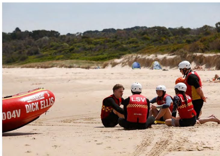
Training on the IRB Course

I once again encourage Nipper parents to consider undertaking IRB training. There has been a real focus on providing officials and set up and pack up crews for carnivals. These are all important roles, but so is water safety. The benefit of IRB