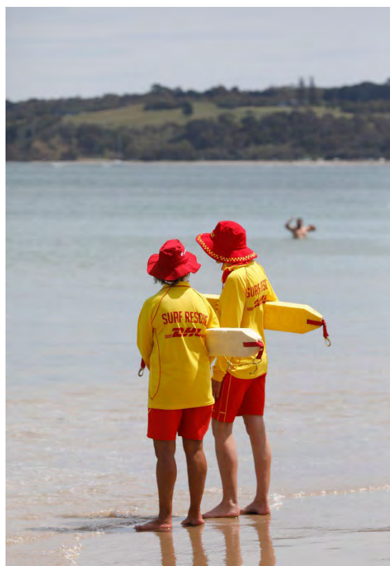
Patrolling the water's edge at Point Leo Beach