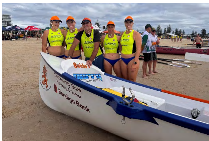
Point Leo Edge

Next was the Victorian Youth Senior Lifesaving Championships at Warrnambool. The Masters Crew (Plato's) represented the Club in the Open Boat (and competed admirably). Great results were achieved by our two Senior crews – Gold to the Mimosa's Women's crew in the Reserve Grade and Silver to the Lounge Lizards Men's crew in Reserve Grade. The boys were a bit stiff in the final considering they won all the heats and semi-final in the lead up. Along with the rowing events the Mimosa crew also won Gold in the Lifesaver relay (this event includes both boats and surf sports). This was the first Gold medal for Point Leo in this event ever and a massive result that shows the depth of talent across all sections / ages and genders of our club.