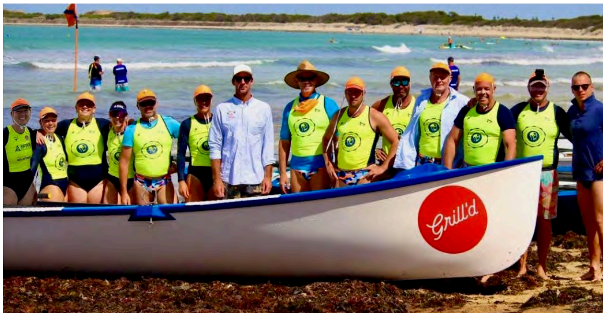
Point Leo 'Boaties'