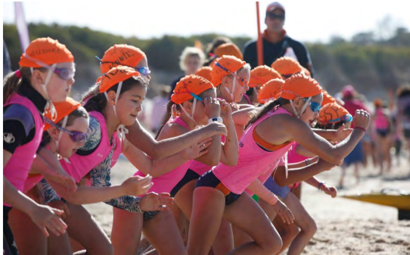
Point Leo Nippers on the start line of the swim

The JSLP program packed a punch with 10 action-filled sessions running from late December through to mid-January. The overall goal being to build skills, boost confidence, and grow water safety knowledge – all while having an absolute blast. Our Nippers dove into everything from survival skills and first aid to board paddling, beach