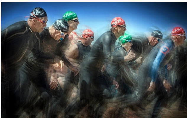
Point Leo Swim Classic

The Boxing Day 2009 Point Leo Swim Classic was again a success. The Swim Classic is a major fundraiser for the Club and an important day on our calendar. Many thanks to our sponsors, our members and the Open Water swim community for their support in making this day a success.