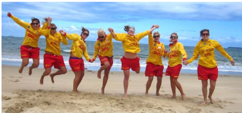
Beach Patrol at Point Leo!

Club Captain's Award and watch him win the State Ironman title at Lakes Entrance. I cried along with the rest of the Leo team!