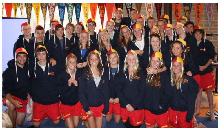
Bronze Camp Presentation 2010

This being my first year in not only the role as Chief Instructor, but also as a member of Point Leo, I thank everyone, especially the committee, who has made me feel welcome. I also thank all of the members who have been involved with the delivery of training programs such as the Surf Rescue Certificate (SRC) course, Bronze camp and IRB programs. I look forward to seeing these programs develop further as the new season commences.