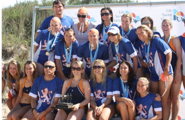
R and R section members receiving the Geoff Waters Perpetual Trophy