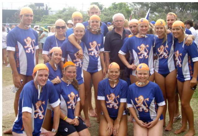
Point Leo Aussie team members 2010

Thanks go to the old boys for organising the club BBQ and dinner. We now look forward to next year for the opportunity to again chase the gold!