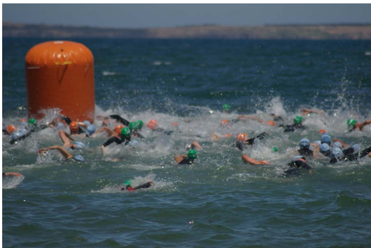
2007 Point Leo Swim Classic