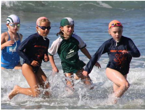
Under 9 Nippers at Warrnambool

Champion Junior Lifesaver of the Year Award at the Junior State Titles. For more competition detail refer to the Junior Report.