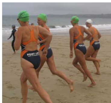
Open Women's Surf Race Club Championships