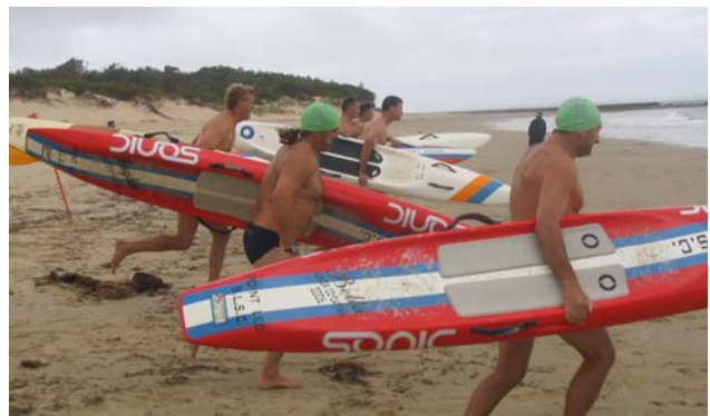
Master's competitors – Club Championships