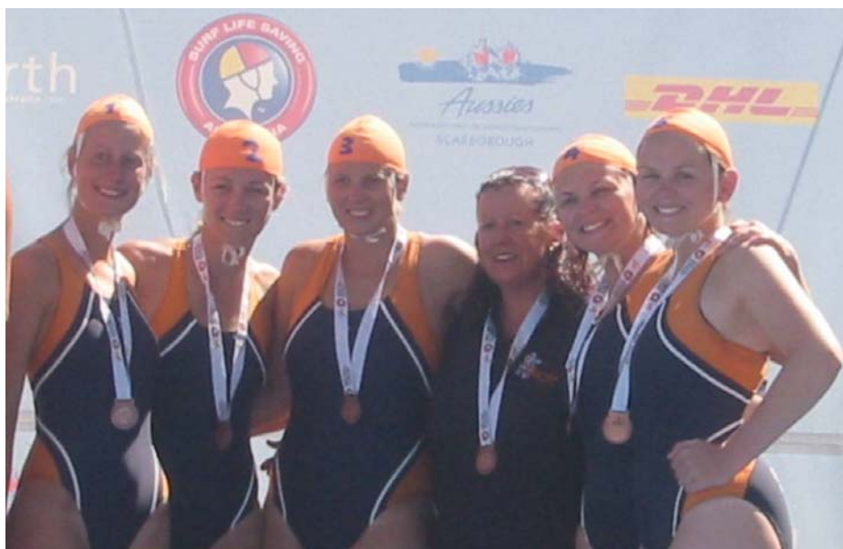
Open Women 5 Person R & R Team – Bronze Medallists Australian Titles 2007 Scarborough Beach WA