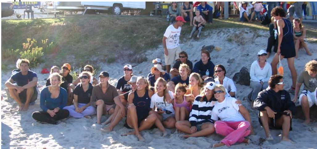
Competitors at State Titles Portland

The State Titles were held at Bridgewater Bay some 17kms from Portland. Our hosts Portland SLSC really put on a terrific carnival in an ideal location and the event was a credit to everyone involved. We ended up with a team of 31 competitors and a group of 25 eager to help supporters.