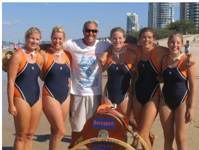
U19 5 Person R & R Team – Silver Medallists Australian Titles 2006 Kurrawa Qld