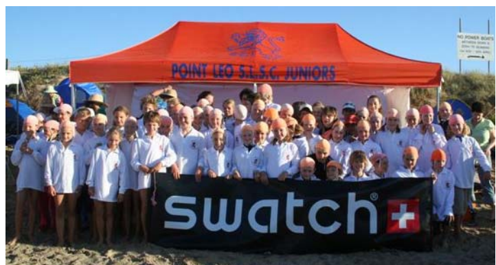
Junior State Titles Team Warrnambool (and new tent)

Along with these medals Point Leo also had 36 placings in the top six. There were many individual outstanding efforts over the week end in some very trying conditions.