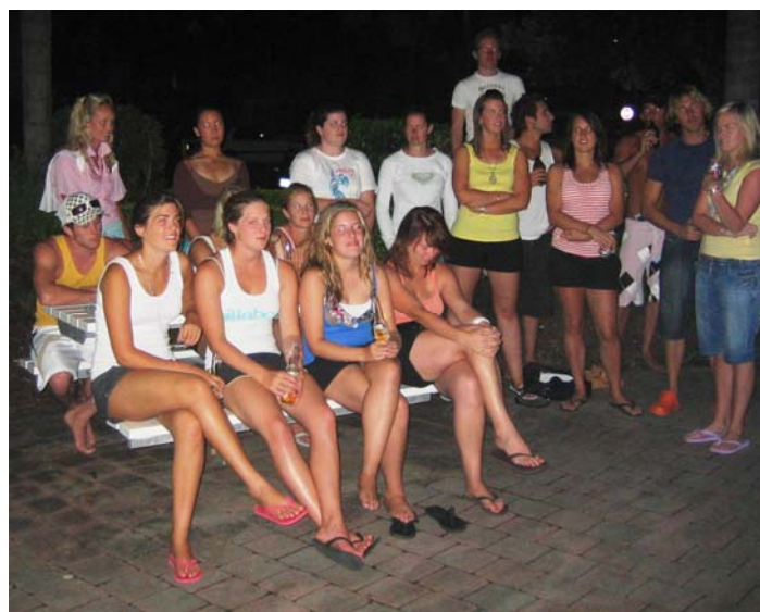
Team BBQ - Australian Titles