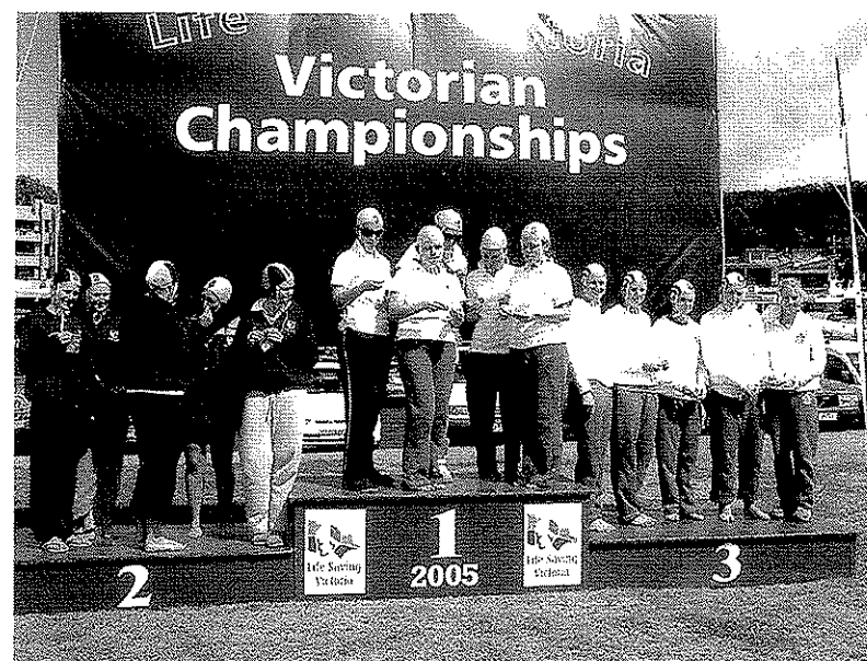
Open Women's R&R 2005 State Champions