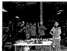
the BBQ team