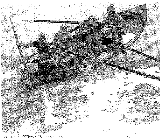
Rowing team in action