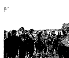
Up at the Crack of Dawn!