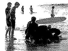
Lifesavers at Work