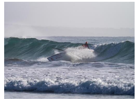
Figure 6: Pt Leo crew at State Masters

100 Club – Following the Draw on BBQ Sunday, I am pleased to announce that the winner for the 100 Club is SEA LEVEL PROJECTS . Congratulations & well done to Ben and his team. A massive thanks to all our Patrons that participated and as outlined your support is the driving force behind the boat section & the success of our crews.