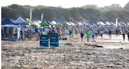
Figure 4: A very busy Point Leo Beach for the nipper carnival

What a fantastic day we had at the Point Leo carnival on Sunday 4 th Feb. There were 135 nippers representing "Team Leo" and a massive 826 total nippers competing. It was magnificent to see all the action and so many kids, running, swimming, and boarding at our beach. To scan the beach and see kids representing their clubs and all the different colored nipper caps was a great site and I can't wait to see the drone photos! There were nippers competing from 8:30am in various events as well as the U11-13 competing in qualifying events for the Junior State titles - Board Rescue, Iron and Belt and Reel. I'm pleased to say we have had several individuals and team already qualify.