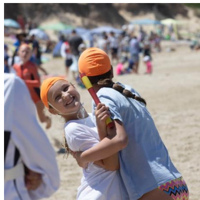
Figure 5: Nippers celebrating their efforts on the day.

A big shout out to @elizabethclancyphotography (nipper mum, master and avid water safety personnel) who took photos at the carnival. The link below is to 300+ photos from the Point Leo carnival https://www.dropbox.com/scl/fo/71k0jsrure6xv2vz6jl3b/h?rlkey=hj5ibhqt7q2hibmoape7ivg7i&dl=0