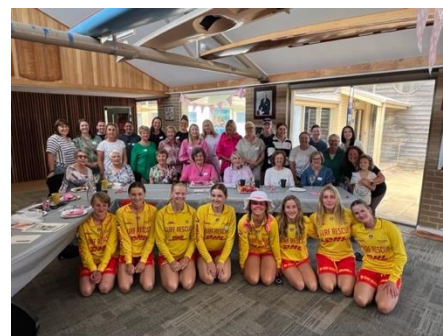
Figure 2: Pink Patrol lunch

On Saturday 20th Jan, Point Leo SLSC hosted another successful Pink Patrol, a celebration of our many talented and skilled female members.