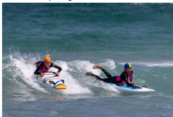
Pictured 25 - Junior State Titles