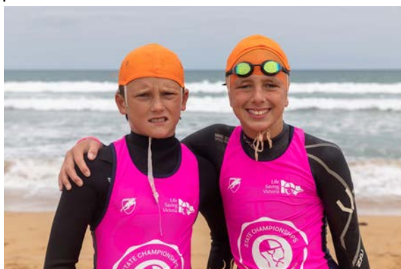
Pictured 24 - Junior State Titles

Congratulations to all our Nippers on a fantastic season and for doing Point Leo SLSC proud! Thank you as always to all our parents, water safety, officials, IRB drivers and crew, trailer driver and other helpers who make Nippers possible.