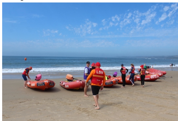
Pictured 9 - IRB drivers and crew preparing the boats for the Boxing Day Swim Classic

Several of the above-named people also turned out at short notice to ensure the Point Leo Gold had adequate water safety in place. Not unlike Boxing Day, relatively benign conditions became quite demanding as winds veered thanks to unexpected storm cells. Thank you to all involved and to Myles again for coordinating during the event.