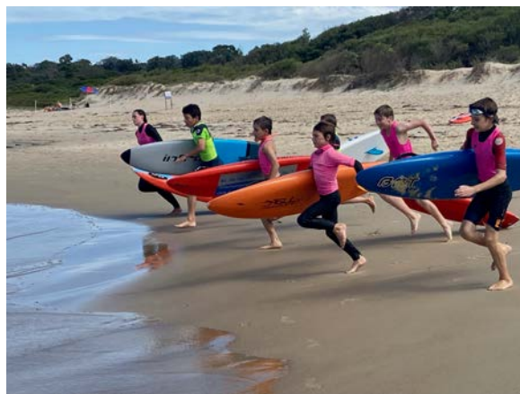
Pictured 22 - Nippers at the final Sunday Session of the season