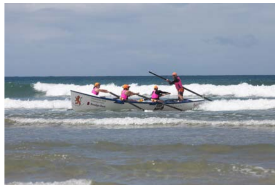
Pictured 17 - The Point Leo Plovers at States.

We expect some further expansion of the Boat section for season 2023-24. There are exciting times ahead with already two new crews underway for next season (Senior Men and Senior Ladies) along with expansion of our current crews.