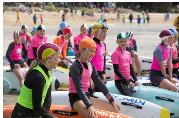
Pictured 23 - Junior State Titles.

The Junior Competition Team has enjoyed a very successful season over 2022-23. We had Point Leo Nippers competing at over five summer carnivals as well as the Junior State Titles at Warrnambool. We also hosted our own carnival at Point Leo which saw us enter a massive 127 Nippers. A lot of those Nippers were competing for the very first time (with a home ground advantage!). Thankfully, it was a stunning day and a great experience for all our families, new and old, to Junior competition. This season focus has largely been on a "come and try year" as well as competing for "Team Leo". Following on from the COVID-19 years most Cubs have not had a chance to get involved in competition and our younger Lions have not had a lot of exposure to competition and carnivals either. We introduced a pay-as-you-go fee system this year which allowed families to pick and choose the most suitable carnivals for their families. As a result of this I'm pleased to report we had great numbers entered in our local carnivals, Mount Martha, and Point Leo, with a keen cohort representing Point Leo at most Junior carnivals and the Junior State Titles.