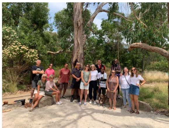
Pictured 4 - Clubbies visiting Willum Warrain

This year, members of the committee, wider club, and community (with representatives from the Bendigo Bank and Point Leo foreshore committee) participated in a Cultural Awareness Tour at Willum Warrain. This step in our journey of information-gathering, understanding, respecting, and celebrating Indigenous Australian culture is a true marker of Point Leo SLSC's commitment to using our platform for the benefit of all. I look forward to further walking down this path, and I encourage you all to engage with local First Nations Australians and groups, as well as consider what we could do on a personal and a club level to recognise the traditional owners of the land properly and respectfully.