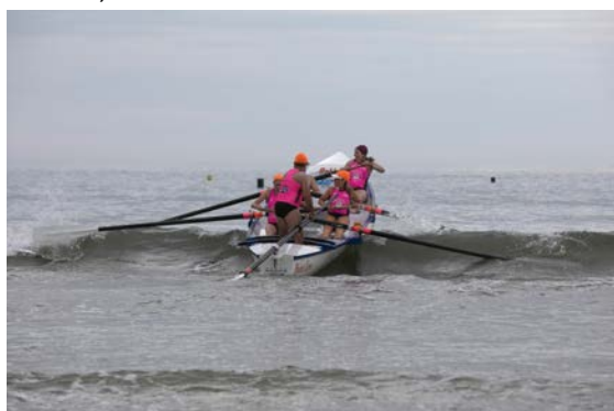
Pictured 15 - The Point Leo Pandoras at States.

A very pleasing 2022-23 season with some continued growth within the section. The boat section fielded four Crews throughout the season as well as many social sessions over the Christmas period to include club members of all rowing abilities. The outstanding 'come and try' participation involved the top age Nippers and their Age Managers. These two sections (Boys & Girls) got to experience the surfboat sensation over a few sessions and the smiles on the faces were fantastic. (A big thanks to those boaties who assisted in 'blooding' our next batch of boaties - something we will roll out again next Nipper season).