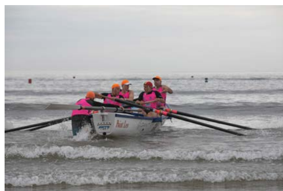
Pictured 16 - The Point Leo Platos at States.