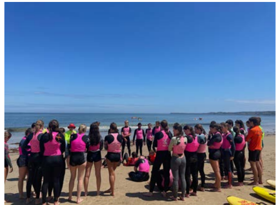
Pictured 11 – Bronze trainees doing beach skills

On Monday 2nd January, 14 participants completed their First Aid award. The course was a great success, and participants gained valuable knowledge on first aid and lifesaving skills.