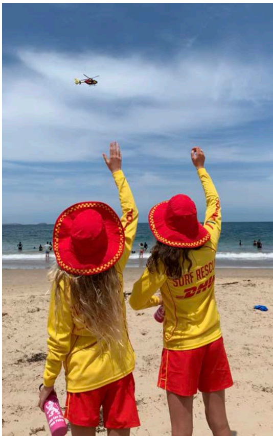
Pictured 6 - The Rescue Helicopter flying past Point Leo on Pink Patrol