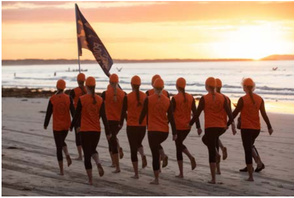
Pictured 13 - The March Past team warming up at Senior States.