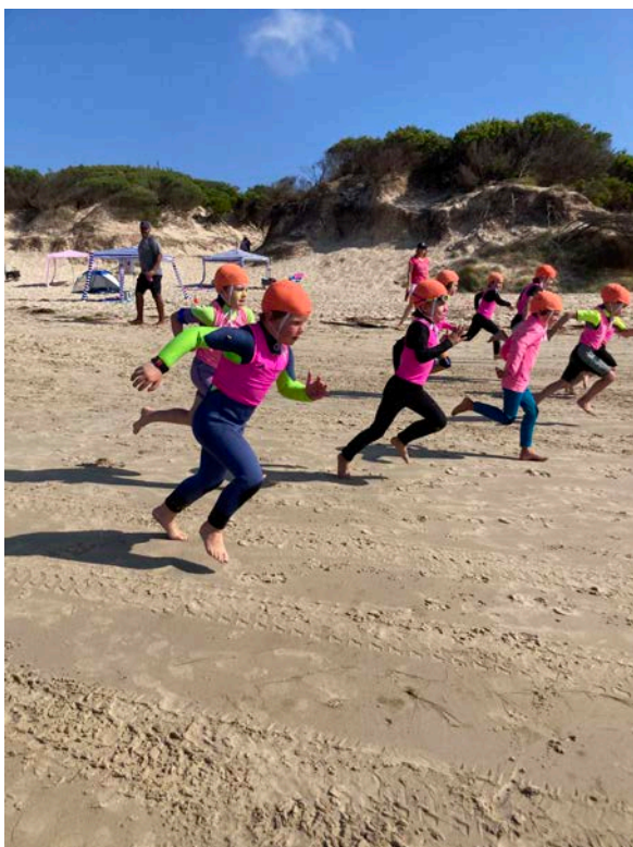
Pictured 20 - Under 7s competing in the Club Champs