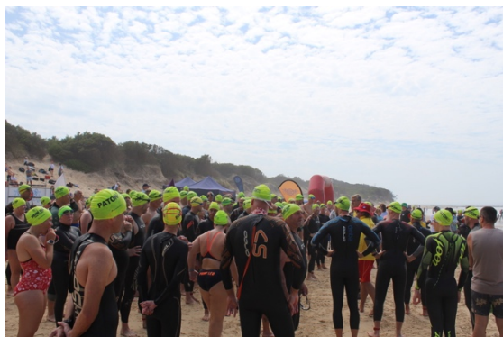
Pictured 30 - Lining up for the 2.5km Open Water Swim

All up we had 504 registrations across all events, with a big surge of interest coming in the week before the event. We had to close registrations on the day to make sure we didn't push the upper limits of our safety and risk organisation. The breakdown of registrations for the event were as follows: