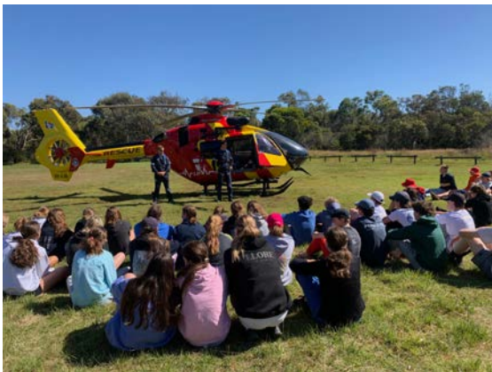
Pictured 10 - The rescue helicopter visiting our bronze trainees

We had 47 participants complete their Bronze Medallion course from Sunday 18th December until Friday 23rd December. Our instructors provided comprehensive training and support, leading to the successful completion of the course.