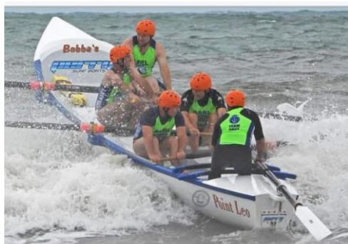
Pictured 13: The Point Leo Platos

With a COVID-19 restricted late start to the season (commencing in December 2021) I am really pleased with the progress the section has made this year. From two Senior Men's crews over the last couple of seasons, the section made a concerted effort to focus on the development of our Junior crews and to get some historical 'Point Leo people' back involved with the section.