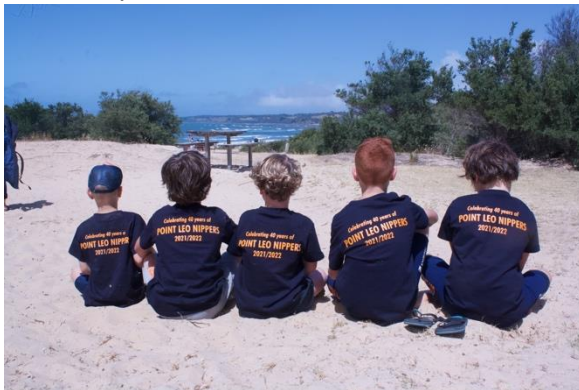
Pictured 19: Celebrating 40 years of Nippers!