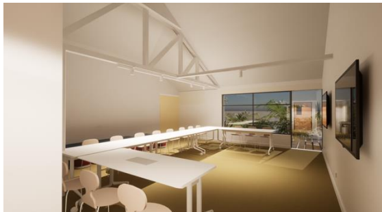
Pictured 29: The plan for the multipurpose room, for which construction will begin in June 2022

leaders. We have now secured funding, approvals and a builder to begin undertaking the 'internal' works, with works recently commencing. The new spaces will be completed within a few months, and will be ready for members to enjoy for next summer!