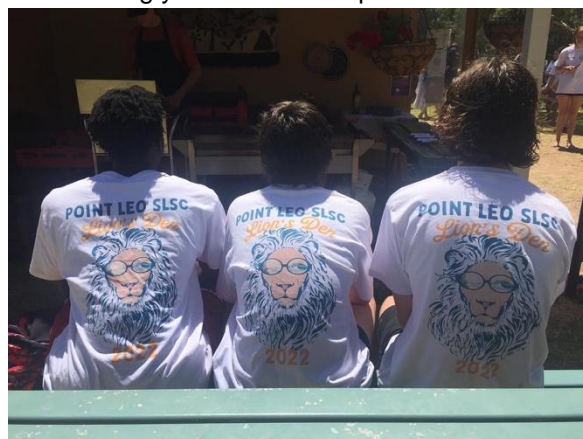
Pictured 23: The 2022 Lion's Den Program