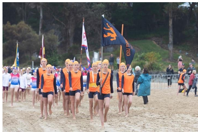
Pictured 21: The March Past team who won Gold at Junior State Championships