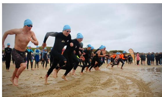
Pictured 27: The 2021 Boxing Day Classic 1.2km Swim