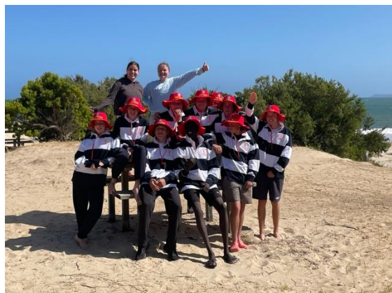
Pictured 9: One of the three groups to complete the Bronze Medallion in the 2021/22 season

Early in the season we ran an ART course to ensure we covered the patrol requirements for awards and to provide opportunities for members to achieve a new award. Well done to all 19 participants who completed this award.