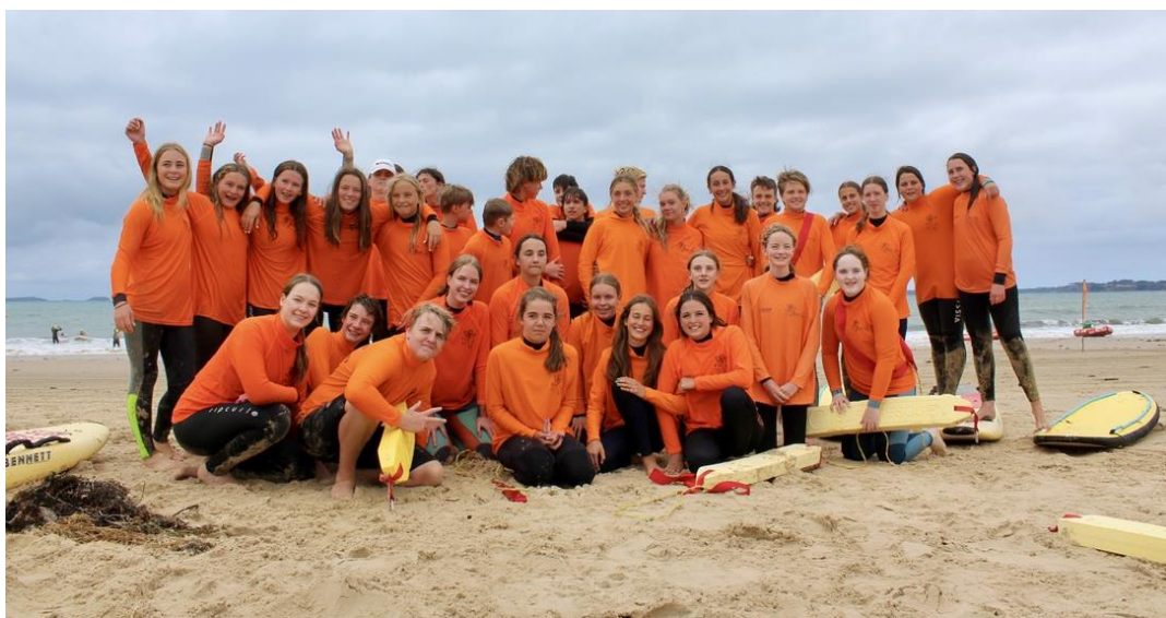
Pictured 6: Water Safety on Boxing Day 2021