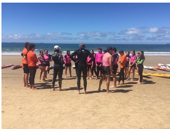
Pictured 22: The 2022 Lion's Den Program