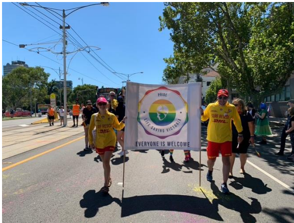
Pictured 4: The 2022 MidSumma Pride March

and our second year hosting a Pride Patrol - an initiative that has spread across Victorian Surf Lifesaving since the inaugural event at our club last year. While we strive to welcome and celebrate the LGBTQIA+ community within our club and surf lifesaving more broadly, we acknowledge there are still barriers to break down and initiatives to be undertaken in the space.