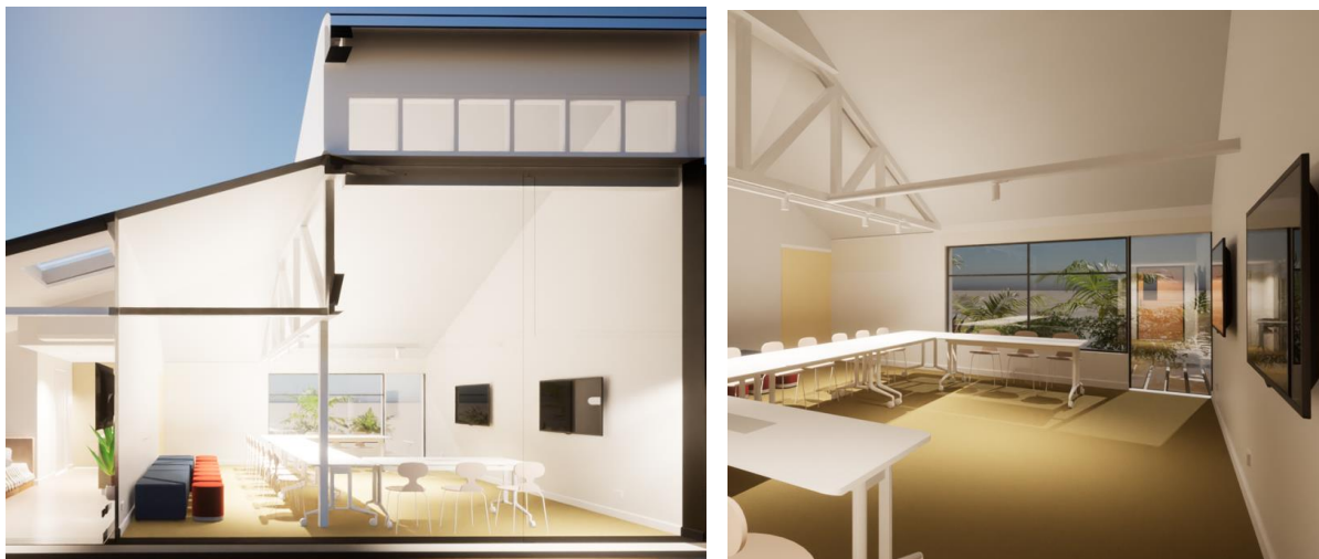
Image: Renders of the proposed multi-purpose room