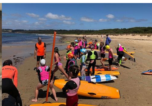
Nipper Competition Training