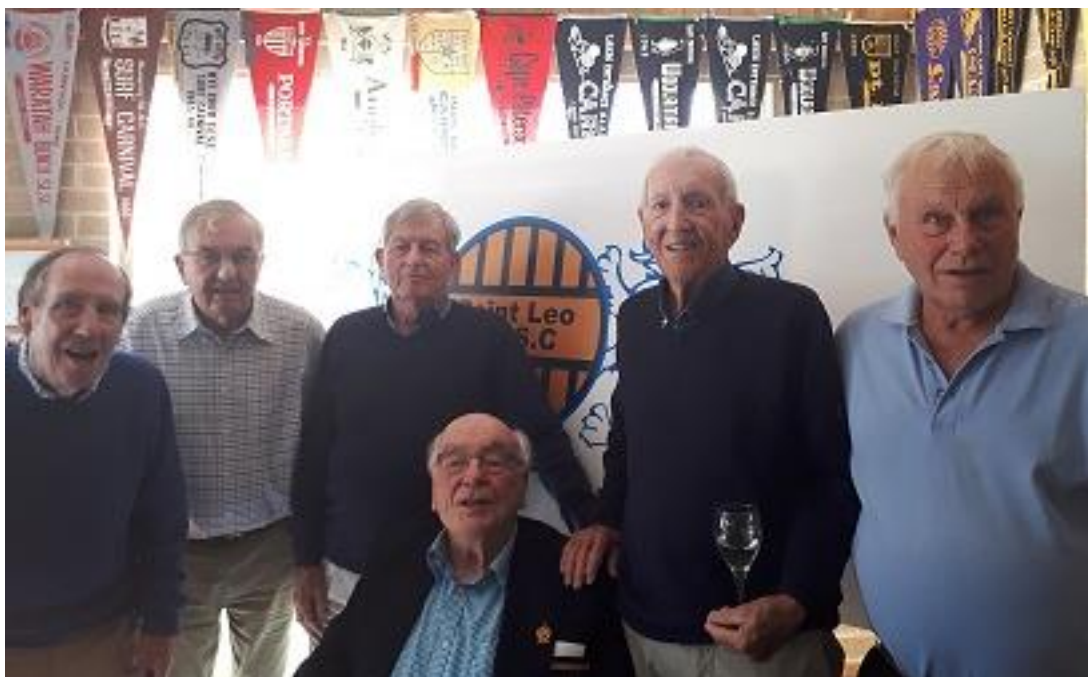
Point Leo SLSC First Bronze Squad Members – May 2019