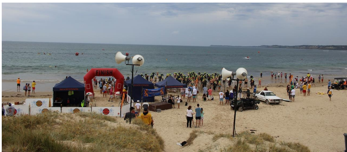
Point Leo Swim Classic 2016