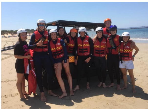
IRB Crew and Driver course participants January 2017