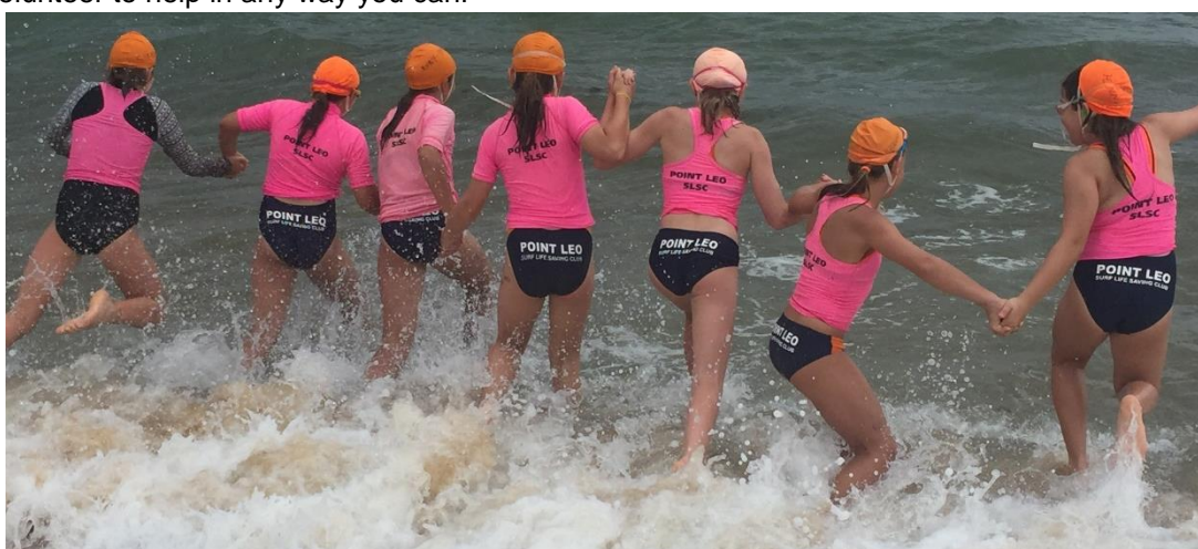
Under 10 Girls

To those parents who haven't yet volunteered, please don't be shy next year. We need you to volunteer to help in any way you can!