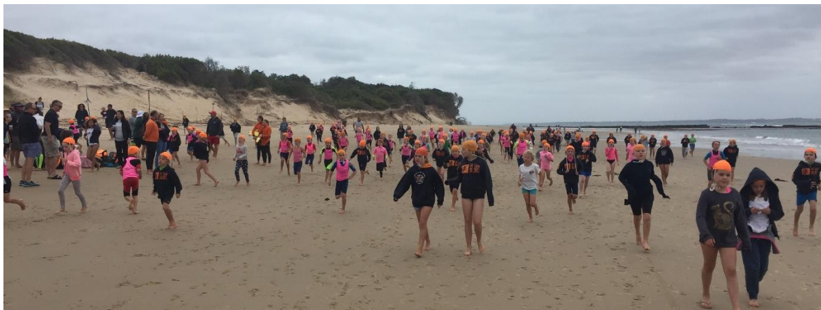
Nipper warm up run

This was my first season as Junior Life Saving Program Coordinator and I confess, I wasn't sure what to expect. Actually, I was scared! But what I found was a group of enthusiastic, happy Nippers and energetic, engaged parents and volunteers who make the program just work. Walking the beach and seeing so many happy children, parents and volunteers was an absolute privilege.