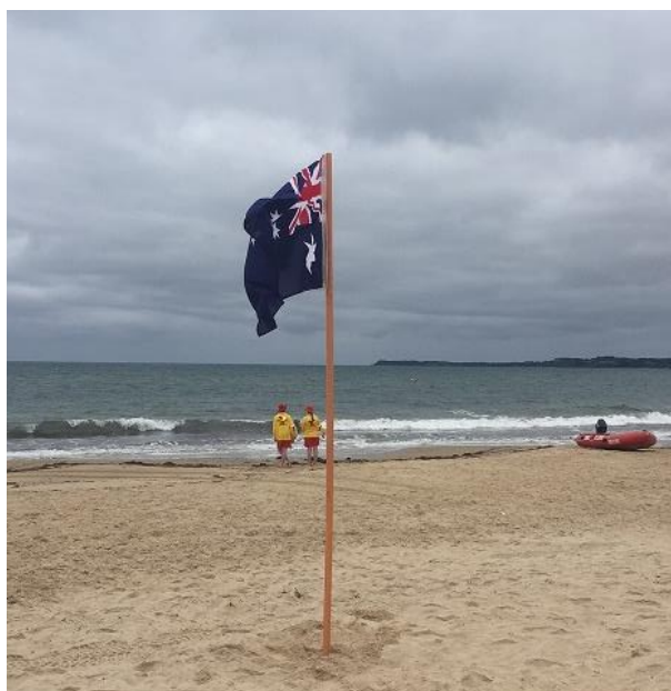
Legends on Patrol