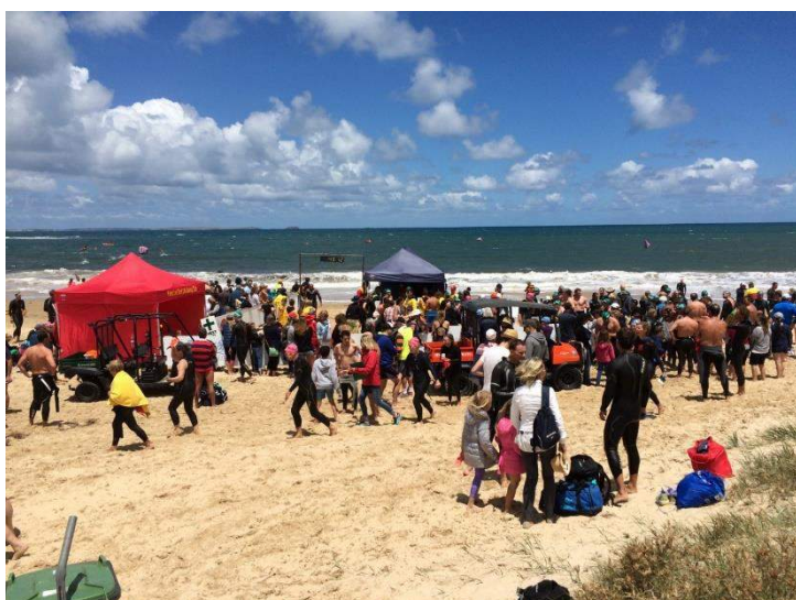
Swim Classic 26 December 2014

Our swim is firmly entrenched as an integral part of the open water swim series; many competitors have told us that the Leo swim is their favourite event of the summer. In no small part this is due to the great vibe that the club creates through the efforts of all those involved.