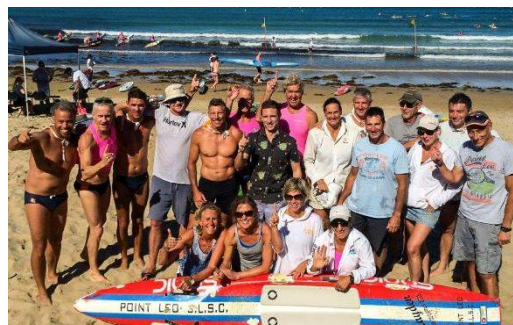
Masters Team 2015