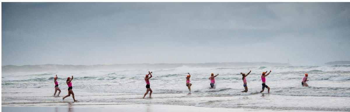
State Titles Ocean Grove March 28th 2015 Point Leo Belt Race Teams

Buildings and items of plant and equipment are recorded in the balance sheet at cost. The value of such items is brought to account as depreciation over the expected life of each asset.