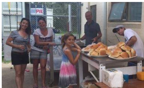
Nipper Cubs Family Night BBQ

The support provided by water safety this year was exceptional. Several of our Nipper parents were awarded their Bronze Medallion during 2014, and along with our existing Bronzies did a fantastic job of keeping our children safe in the ocean and providing encouragement and reassurance to so many. Our newly qualified SRCs were also amazing, and their care and patience with the children was awesome.