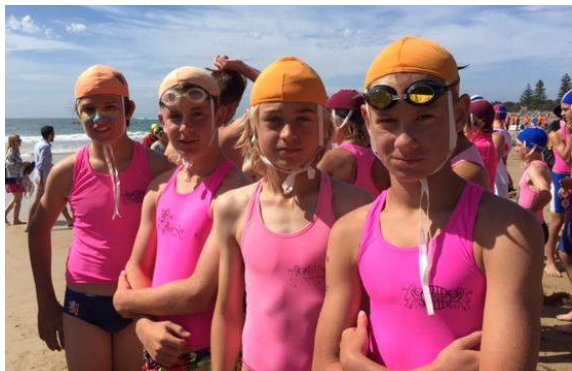
U14 boys at Cosy Corner carnival January 2015

It has been another fantastic summer for our Point Leo Junior Surf Lifesaving Program. Our Nippers spent their summer holidays developing their abilities in ocean swimming, board paddling, beach sprinting, flags and increasing their endurance. Practising these skills helps develop competence and confidence in the surf environment. It also allows children to compete in Club, Regional and State Lifesaving carnivals.